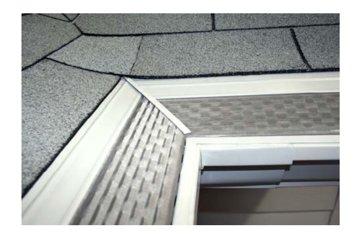
InsideCorner H-Splice application

Corners & Panel Connections- To install your material around corners utilize the "H" splice to attach the two panel butt joints, or mitered ends. Then screw into each panel to secure. Splash guards or diverters may be required for high volume valleys to contain rain flow into gutters. The "H" splice underside may be field cut back to accommodate over the gutter lip applications.