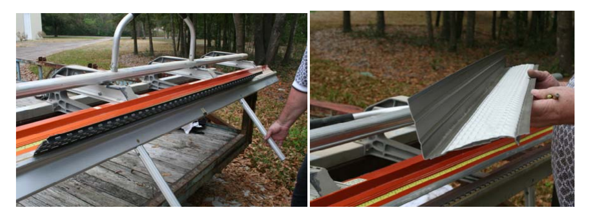
Field forming for fascia mount applications using a small sheet metal hand brake