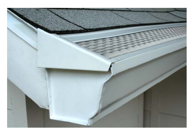
Field fabricate end cap cover

End caps- Where end caps are needed, use gutter coil as needed to field manufacture. Keep in mind that there MUST be no openings larger that \frac{1}{4} ".