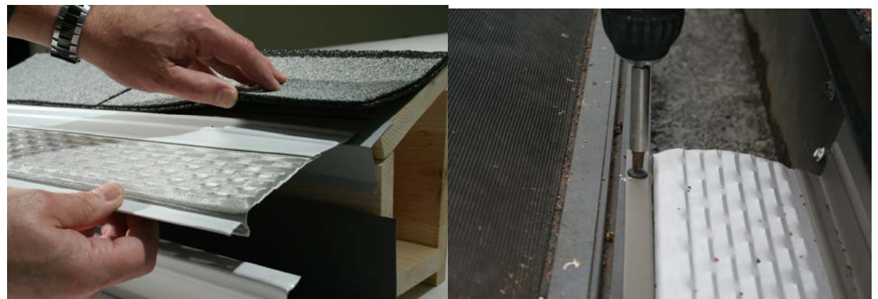
Installed beneath 1<sup>st</sup> shingle

Once in place, secure in place to the gutter lip using min. # 6 \times \frac{1}{2} " Hex washer head piercing point screws approximately 1" from each end, and in the middle of the panel.