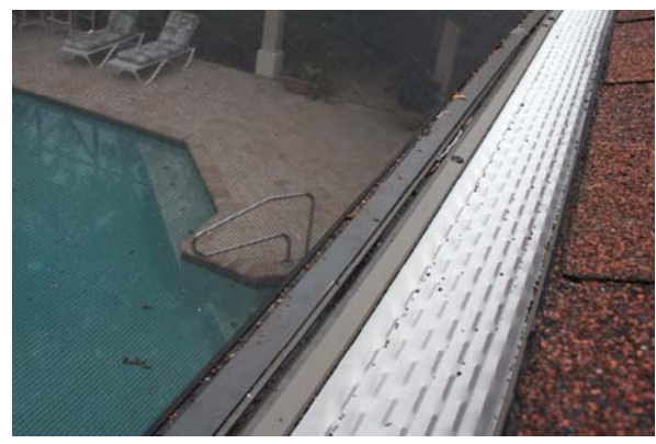
Fascia mounts for metal roofing