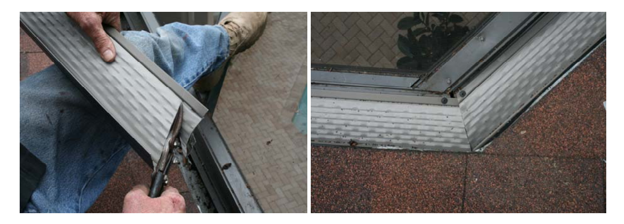
Panels may be easily cut-to-fit using sheet metal snips