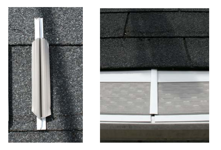
H-Splice Butt Joint

End caps- Where end caps are needed, use gutter coil as needed to field manufacture. Keep in mind that there MUST be no openings larger that \frac{1}{4} ".